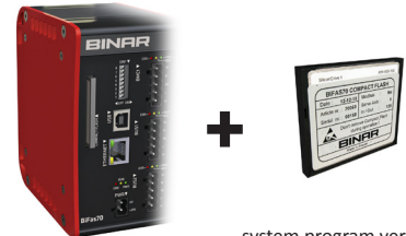
previous BiFas70 system program version v2.01.00 or later