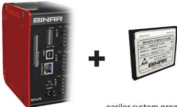
previous BiFas70 earlier system program version than v2.01.00