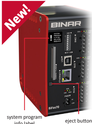
system program info label eject button