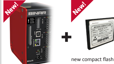
new compact flash with system program version v2.01.00 or later (incl. in the new BiFas70)