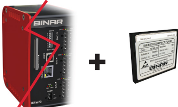
previous BiFas70 to be replaced earlier system program version than v2.01.00